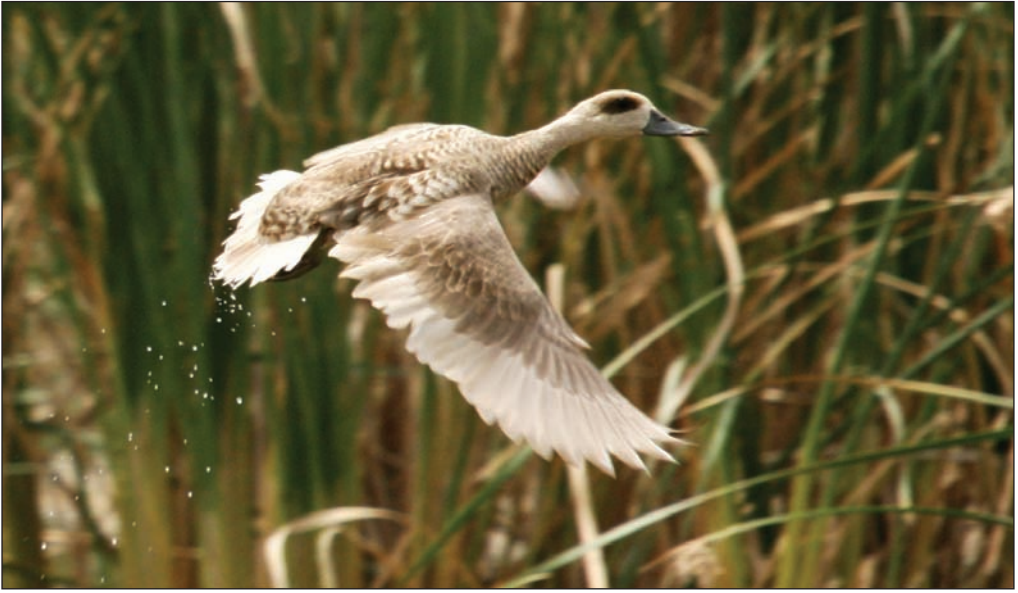
Plate 3. Marbled Duck Marmaronetta angustirostris , southern marshes, Iraq, May 2009.

Northern Shoveler Anas clypeata . Fairly widespread passage migrant and winter visitor, especially frequent in southern marshes; some remain in summer (A60–62, SC82, NI).