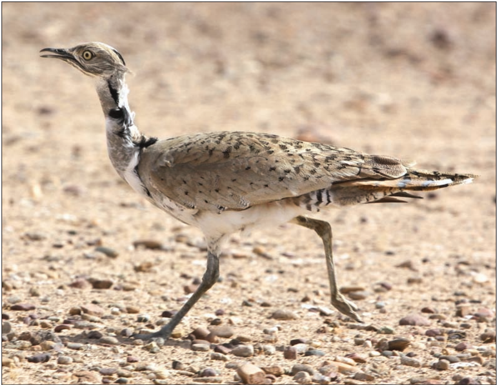
Plate 10. Macqueen's Bustard Chlamydotis macqueenii , central Iraq, October 2010.

Water Rail Rallus aquaticus . Fairly widespread passage migrant and winter visitor (A60–62, SC82, NI).