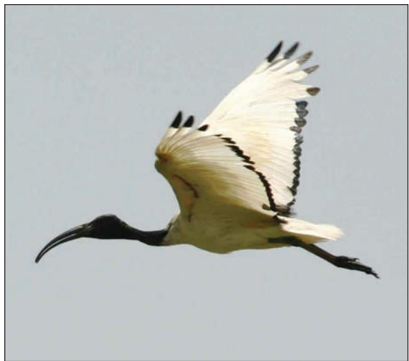
Plate 5. African Sacred Ibis Threskiornis aethiopicus , southern marshes, Iraq, July 2005.

Northern Bald Ibis Geronticus eremita CE. Formerly very rare passage migrant or vagrant in central Iraq but only recorded in 1910s and early 1920s (Ticehurst et al 1922, 1926, A60–62); in 2006 satellite signals from tagged birds from the tiny Syrian