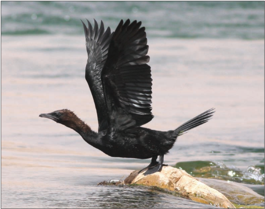
Plate 6. Pygmy Cormorant Phalacrocorax pygmeus , Al-Qadissiya lake, Anbar province, Iraq, May 2011.

Pygmy Cormorant Phalacrocorax pygmeus . Breeding resident in dense reed vegetation in southern marshes; fairly widespread winter visitor (A60–62, SC82, NI, Plate 6).