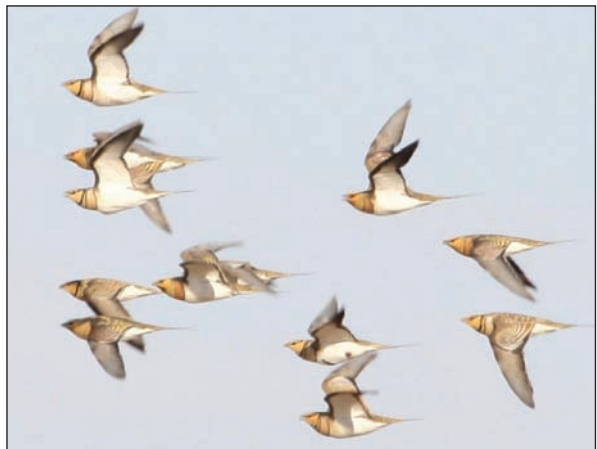
Plate 12. Pin-tailed Sandgrouse Pterocles alchata , central Iraq, March 2011.

Spotted Sandgrouse Pterocles senegallus . Very local breeding resident in deserts and semi-deserts in southern and western Iraq (A60–62, SC82, NI).