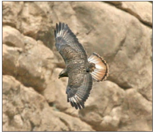
Plate 8. Steppe Buzzard Buteo buteo vulpinus , Kurdistan, Iraq, April 2009.

Eastern Imperial Eagle Aquila heliaca V. Uncommon, but fairly widespread passage migrant and winter visitor (A60–62, SC82, NI, Plate 9).