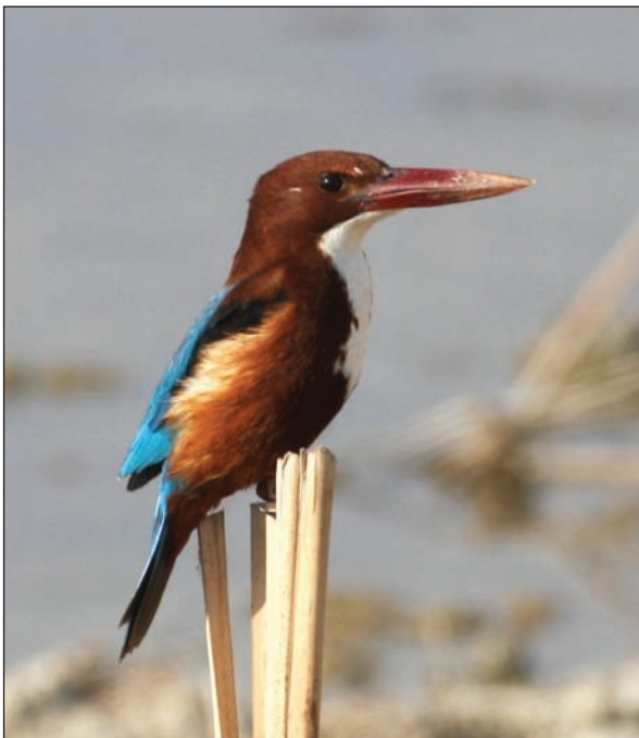
Plate 16. White-throated Kingfisher Halcyon smyrnensis , southern marshes, Iraq, January 2010.

Syrian Woodpecker Dendrocopos syriacus . Fairly widespread breeding resident in northern woodland (A60–62, MB56, NI).