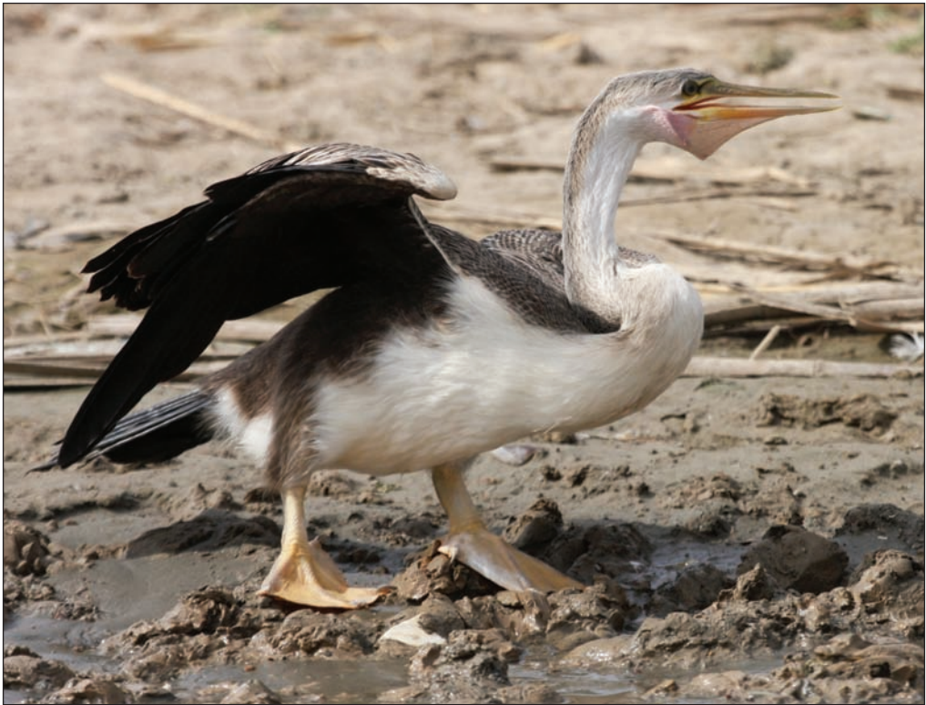
Plate 7. African Darter Anhinga rufa , southern marshes, Iraq, June 2010.

Black Kite Milvus migrans . Fairly widespread passage migrant and winter visitor (A60–62, SC82, NI).