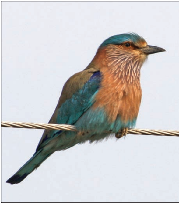
Plate 15. Indian Roller Coracias benghalensis , middle Euphrates, Iraq, February 2010.

Common Kingfisher Alcedo atthis . Uncommon breeding resident in southern and central Iraq possibly also in northern Iraq; winter visitor and passage migrant (A60–62, MB56, Al-Dabbagh 1998, NI).