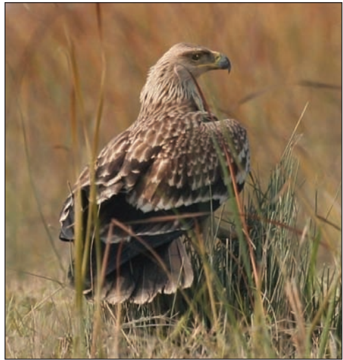
Plate 9. Eastern Imperial Eagle Aquila heliaca , southern marshes, Iraq, 2008. © Omar Fadhil Al-Sheikhly