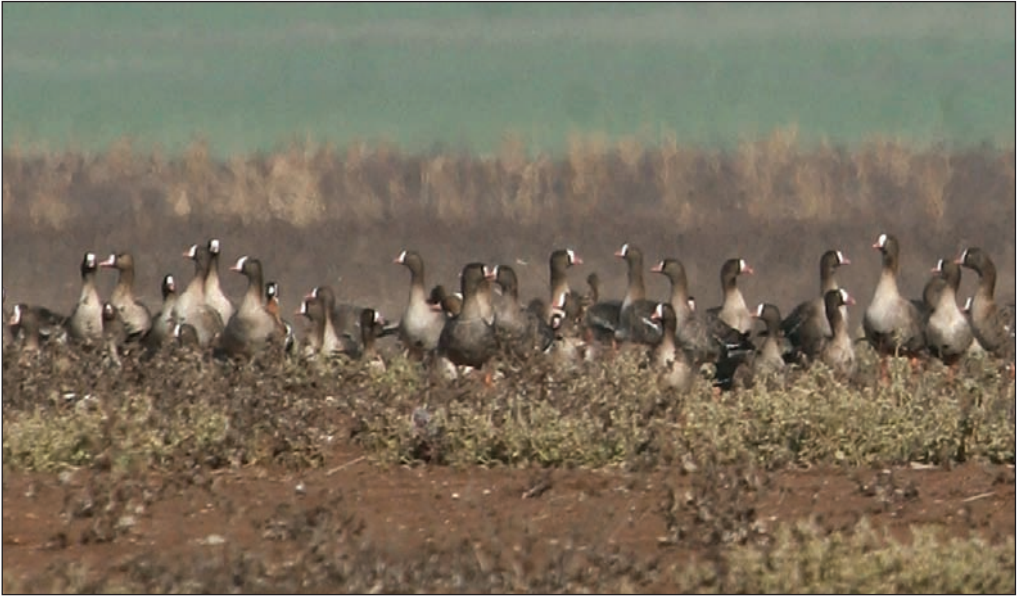
Plate 2. Lesser White-fronted Geese Anser erythropus , Kurdistan, Iraq, January 2010.

Lesser White-fronted Goose Anser erythropus V. Rather local winter visitor in northern Iraq, rare in southern marshes (A60–62, SC82, NI, Plate 2).