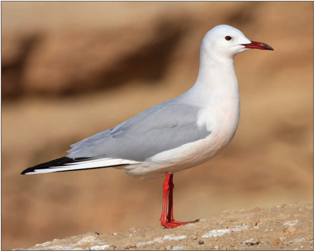
Plate 11. Slender-billed Gull Chroicocephalus genei , Razzaza lake, Karbala province, Iraq, January 2009.

placed all grey-backed gulls in the taxon Larus argentatus Herring Gull. Furthermore, Ticehurst et al (1922, 1926) listed Larus fuscus taimyrensis and Larus argentatus vegae , taxa that are now known not to occur in the Middle East; furthermore Allouse (1953) mentioned Larus argentatus heuglini , giving Ticehurst et al (1922) as the reference; however Ticehurst did not include it.