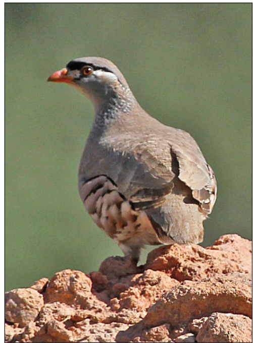
Plate 1. See-see Partridge Ammoperdix griseogularis , Kurdistan, Iraq, April 2011.

Greater White-fronted Goose Anser albifrons . Winter visitor to northern wetlands and agricultural land, also southern marshes (A60–62, SC82, NI).