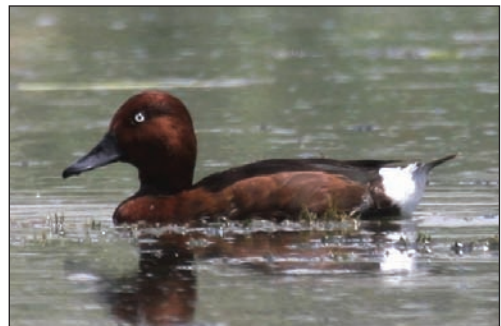
Plate 4. Ferruginous Duck Aythya nyroca , middle Euphrates, Iraq, June 2009.

Ferruginous Duck Aythya nyroca NT. Local breeding resident in southern and central Iraq; uncommon passage migrant and winter visitor (A60–62, SC82, Ar11, NI, Plate 4).