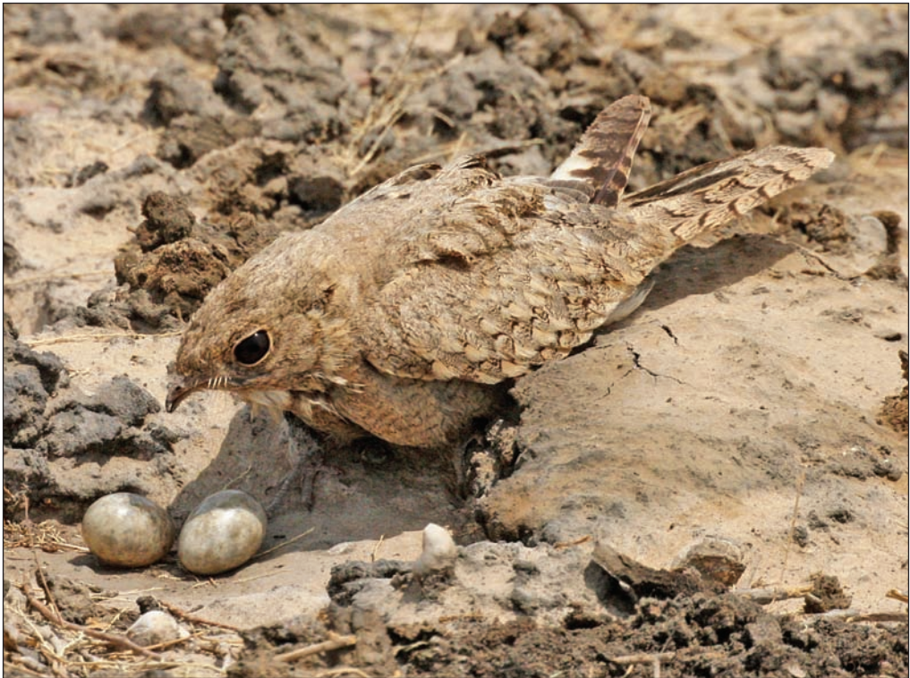
Plate 14. Egyptian Nightjar Caprimulgus aegyptius , middle Euphrates, Iraq, July 2011.

Egyptian Nightjar Caprimulgus aegyptius . Breeding summer visitor to semi-deserts and arid areas of southern and central Iraq, and possibly northeast; passage migrant in south and central Iraq (A60–62, MB56, Marchant 1961, 1962, Sage 1960, NI, Plate 14).