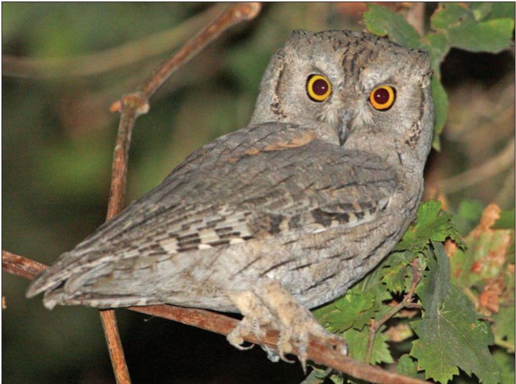
Plate 13. Pallid Scops Owl Otus brucei , central Iraq, October 2010.

Brown Fish Owl Bubo zeylonensis . Not recorded since 1920s but could still occur as a very rare resident (Salim et al 2006, A60–62).